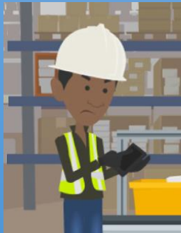
"slow, disconnecting scan gun"